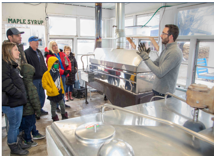
Workshop participants will receive both classroom and hands-on maple syrup production experience.

Workshop attendees will immerse themselves in the world of the state's maple syrup industry